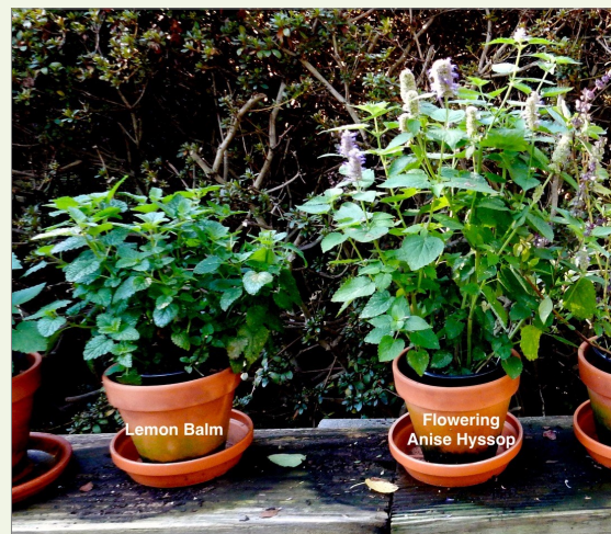
What is Linda Leister up to, growing these pollinator-friendly herbs?