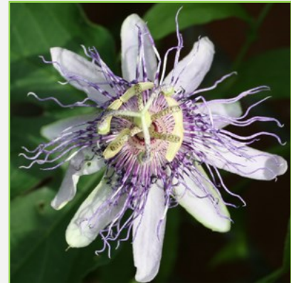
Passiflora incarnata Passionflower