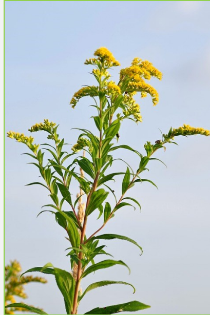
Goldenrod Autumn Asters are coming!