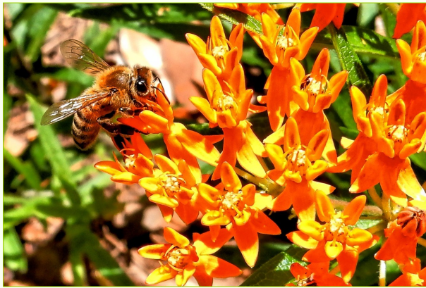
Honey bee nectaring on Asclepias tuberosa , butterfly milkweed