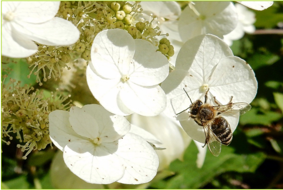
Apis mellifera on Hydrangea quercifolia , oakleaf hydrangea