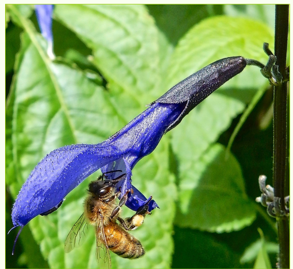
Gathering pollen from Salvia guaranitica 'Black and Blue'