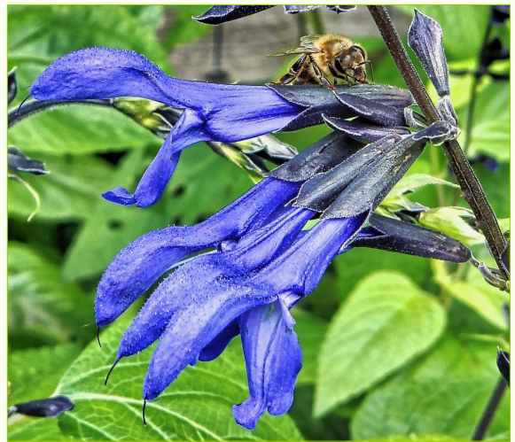
Robbing nectar from Salvia guaranitica 'Black and Blue'

https://growingsmallfarms.ces.ncsu.edu/growingsmallfarms-gardentours/ or 919-542-8202.