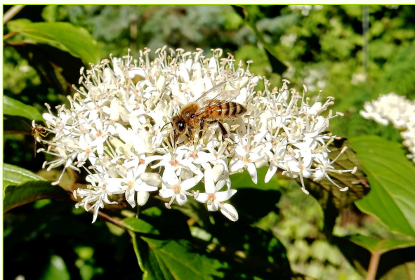
Cornus amomum , silky dogwood

These beautiful plants are growing at Geoff and Linda Leister's home. Thanks for sharing, y'all!