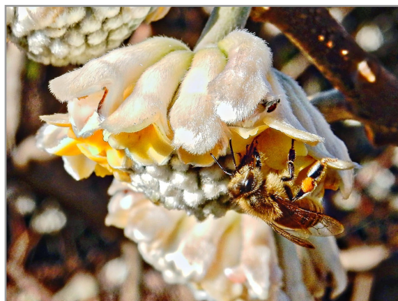
Paperbush | Edgeworthia