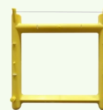
Bee Gym: Chemical- Free Varroa Grooming

http://www.vita-europe.com/products/bee-gym/