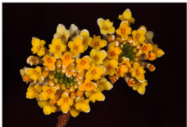
Paperbush | Edgeworthia