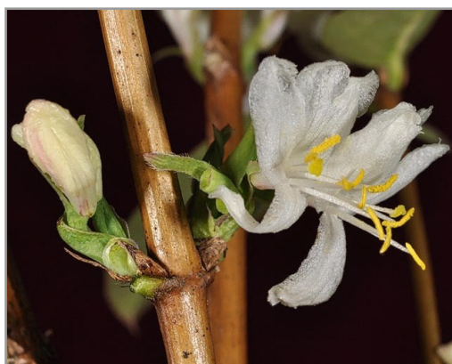
Winter Honeysuckle | Lonicera frangrantissima