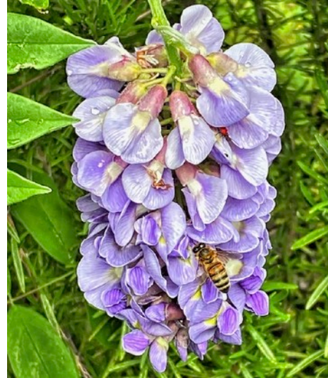
Clockwise from left: Silver-Spotted skipper (Epargyreus clarus) nectarine on American Wisteria (Wisteria frutescens), Honey bee (Apis mellifera) foraging on our native American Wisteria, Female Carpenter bee (Xylocopa virginica) foraging on American Wisteria , Honey Bee foraging on yellow pollen on Catmint