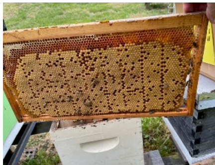
This is what I found in one of my swarm traps. They must have moved in right after I put them out in late March. She might be a candidate for grafting !! - Ira Poston