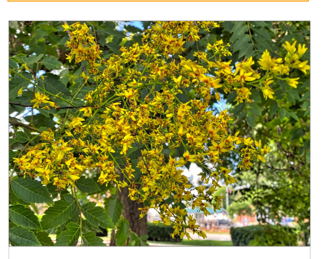
Golden Rain Tree, <u>Koelreuteria paniculate</u>, Gibsonville, June 10.

https://entomology.ces.ncsu.edu/2018/.../unwanted-pool-guests/