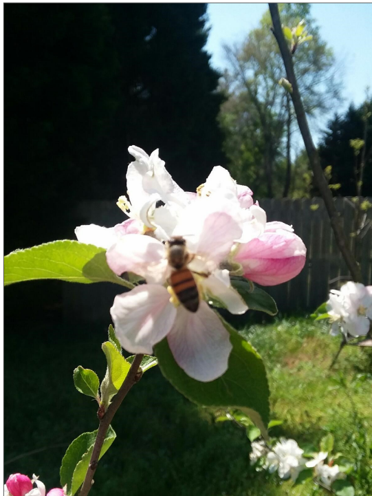
Honey bee visiting apple blossoms