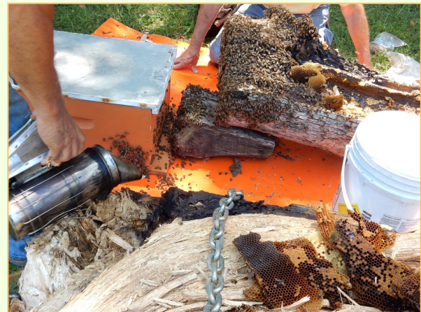
Bees on the march into their new hive