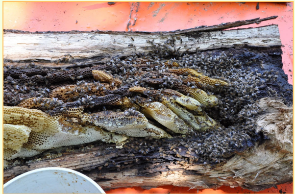
Honey bees in opened log