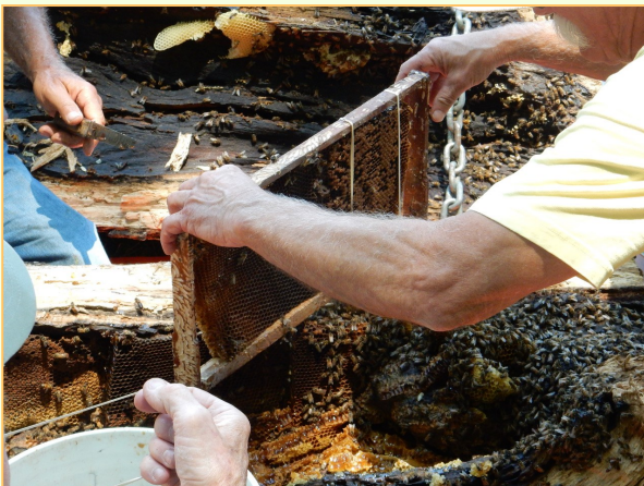
Transfer of comb to frames