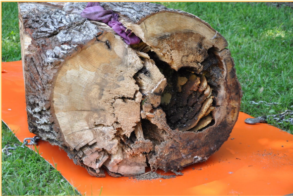
Honey bees in whole, un-opened log

The grill masters, Ira & Paul, provided the hot dogs and hamburgers. That was followed by the removal of a large feral colony of honey bees from the trunk of an old oak tree. The damaged oak with bees was removed from the owner's property about three weeks ago and then moved to Ira's apiary. After the trunk was split, the feral wax comb with brood, pollen, and some honey was cut to size, removed and added and secured with rubber bands into 10 empty frames. Those were then placed into a 10-frame hive body along with the all of the bees. These nonaggressive bees eventually all marched into their new home, as shown in the last photo.