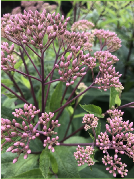
St. John's Wort (above) and Joe-Pye Weed (right) are favorites of honey bees and other pollinators. Both plants are native to the southeastern US.