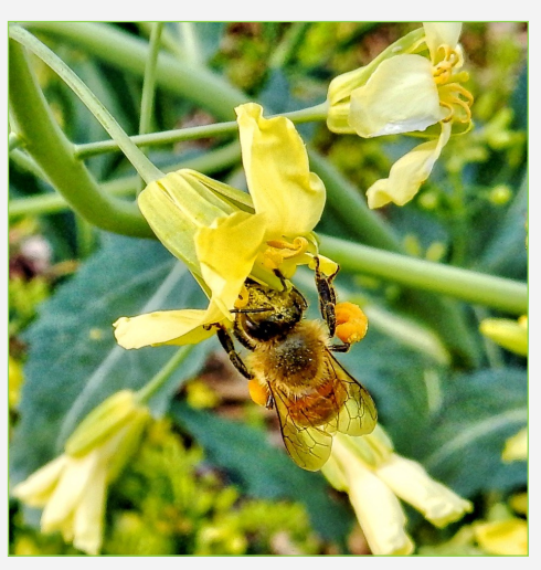
Honey bee visiting collard flower