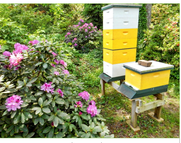
Bee Hive with a View | Leister Apiary