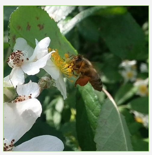
Honey bee visiting blackberry flower