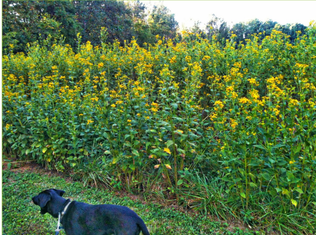
Tip-toeing through the Verbena with Tank

"The flowers are visited primarily by long-tongued bees, especially bumblebees. Some short-tongued bees, butterflies, and skippers also visit the flowers; the long tubes of the disk florets make the nectar inaccessible to many insects with shorter tongues, such as flies and wasps ..."