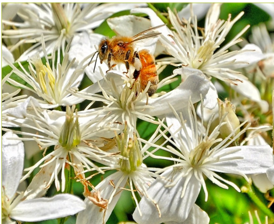
Clematis terniflora , or Sweet Autumn Virginbower.

What will a bee get from visiting too many flowers? High bud-pressure.