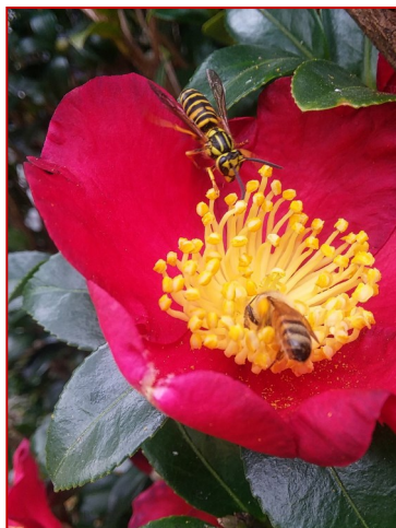
Honey bee and yellowjacket on Camellia sasanqua