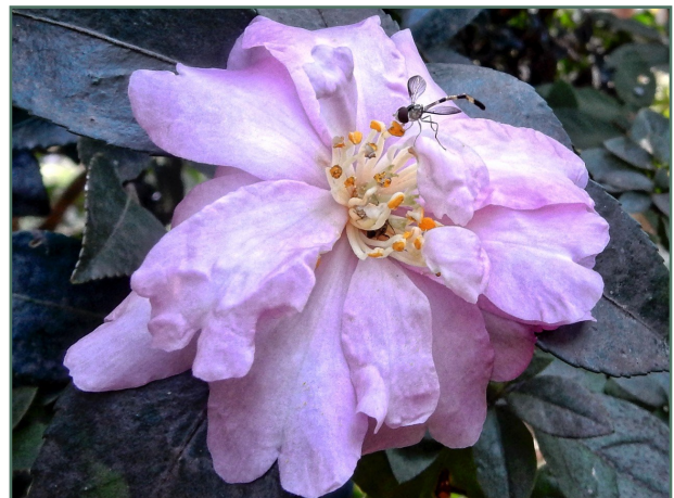
Unusual hover fly Baccha elongata (or Flower Fly) on Camellia. photo of a beautiful alternative pollinator.