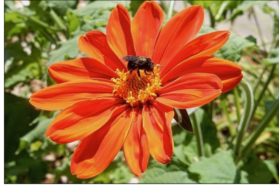
Long-horned bee ( Melissodes bimaculatus ) on Mexican sunflower ( Tithonia rotundifolia )