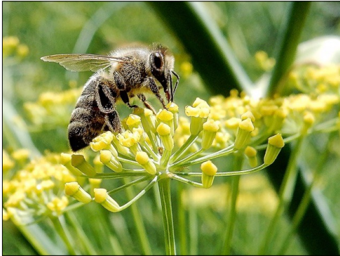
Honey bee nectaring on sweet fennel ( Foeniculum vulgare )