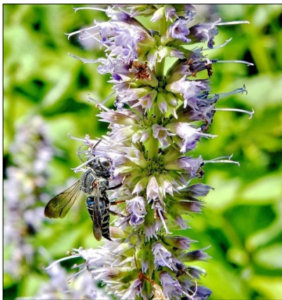
Female cuckoo leafcutter bee ( Coelioxys porterae ) on anise hyssop ( Agastache foeniculum )