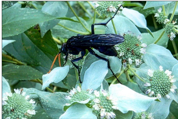
Spider wasp ( Entypus unifasciatus ) nectaring on mountain mint ( Pycnanthemum muticum )