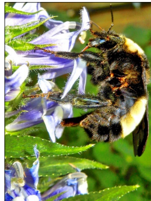
American (queen?) bumblebee ( Bombus pensylvanicus ) nectaring on great blue lobelia ( Lobelia siphilitica )