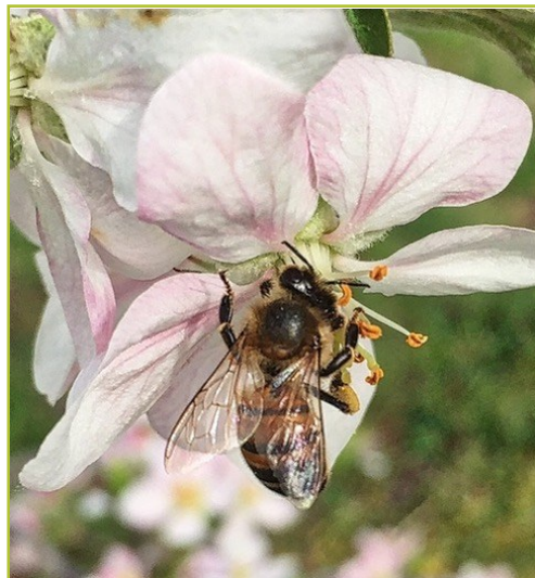
Honey bee visiting apple blossom in Chuck Perkins' orchard.