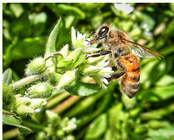
Honey bee on chickweed, 3/31/2017.